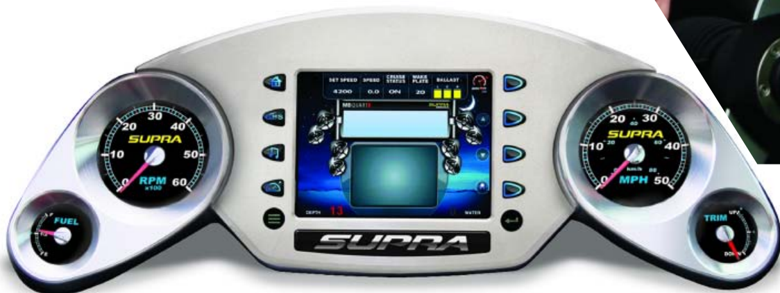
HV1000i™ Color Display & customed Bezel